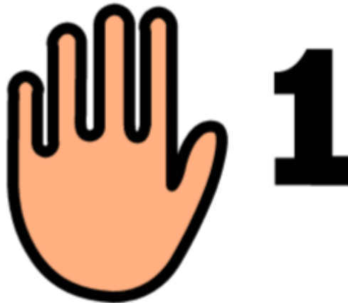
Wait 1 Minute