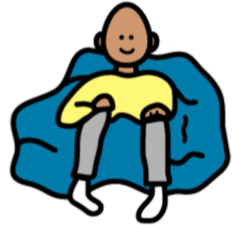
I need a break