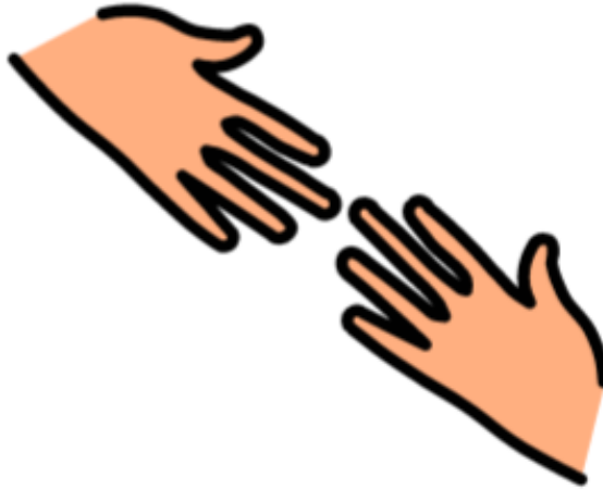
Do you need help?